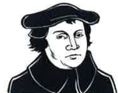
MARTIN LUTHER 1483-1546